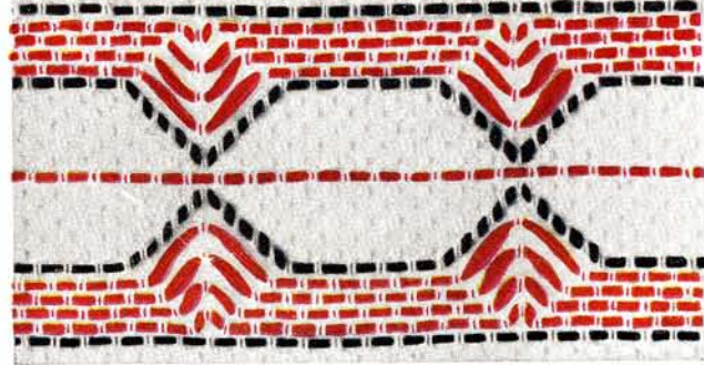
1 Skein ea. Bright Red and Black.