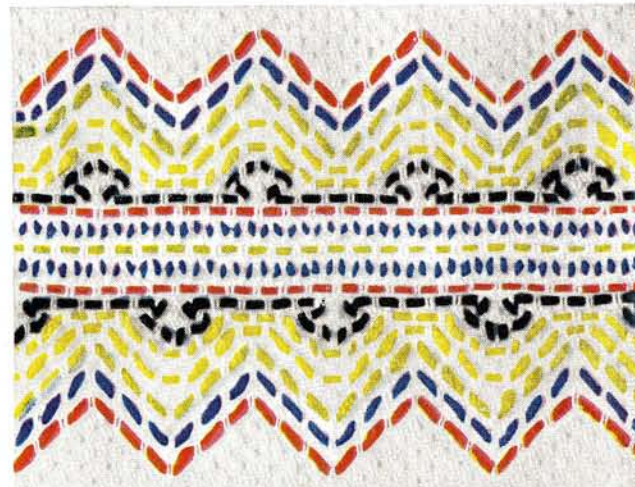
1 Skein ea. Dk. Orange, Marine Blue, Chartreuse or Spring Green, Yellow and Black.

Use any of the AMERICAN THREAD COMPANY Products listed below for Swedish Embroidery. 1 skein of each color illustrated is needed.